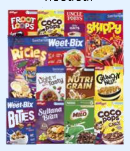
Please give if you are able to.

This fortnight our focus is on breakfast cereals or anything that is on special that may be needed.